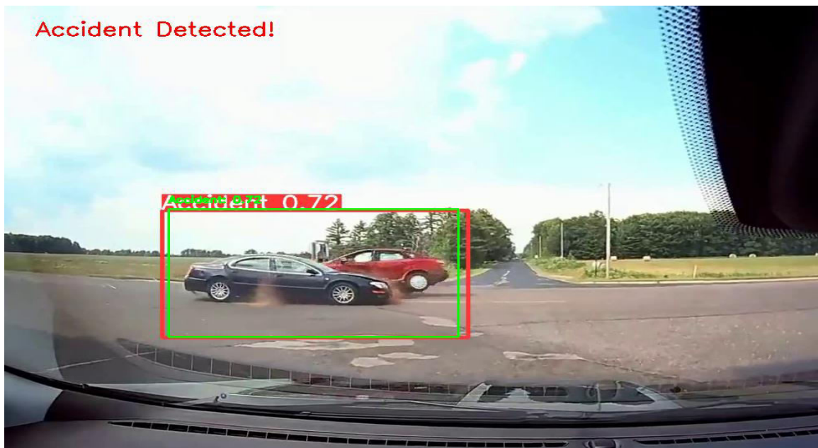
Figure 4: Output