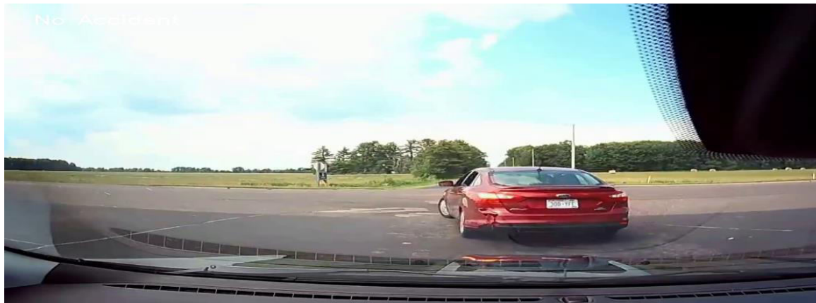
Figure 3: input